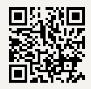
Tour the Bunkhouse!